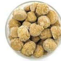
Curry madras (4g) 2349-18 ready to heat