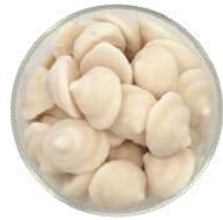
Graviola puree (4g) 2125-18