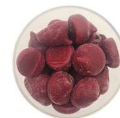
Herbal berry (6g) 5245-22 Blackcurrant, raspberry, blueberry, water, rosemary