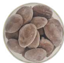
Dark chocolate (6g) 0634-23