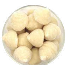
Whole apple puree (8g) 3742-18 ready to eat 4403-16 ready to heat