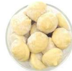
Lemon grass puree (4g) 3750-18 ready to heat