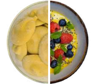
Topical bowl (6g) 4496-22 banana puree, mango, pineapple, coconut milk, passion fruit, locust bean gum, fibre