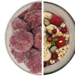
Acai bowl (6g) 4497-22 banana pulp, açai* pulp, blueberry, cherries, water, locust bean gum, fibre

Ever tried to make a proper thick bowl in the blender? Yes, then you know the blender struggles with the high viscosity. Our frozen drops are a solution made in heaven. All ingredients pre-blended & correct viscosity when defrosted. After defrosting in the fridge for a few hours you can add your favourite toppings. They don't even sink in the bowl,