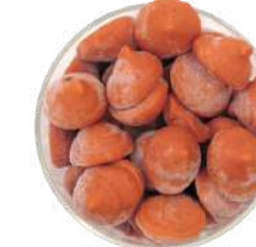
Grilled red pepper (8g) 3737-18 ready to eat 3182-17 ready to heat