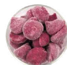
Raspberry puree (8g) 4019-18 ready to eat 3732-18 ready to heat