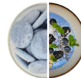
Blue spirulina bowl(6g) 1553-22 banana puree, coconut milk, water, locust bean gum, fibre, spirulina extract powder