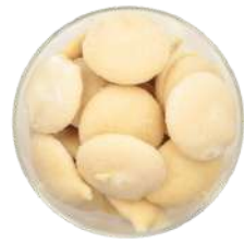
Banana puree (8g) 2348-18