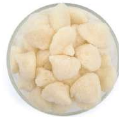
Oat frappé base (6g) 4926-22