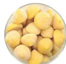
Passion fruit seedless (4g) 3503-16