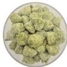
Green pesto drops