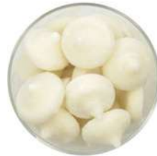
Tzatziki dressing drops