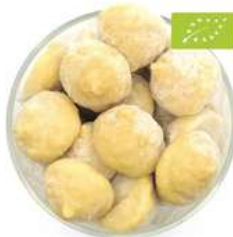
Ginger puree (4g) 3747-18 ready to eat 2963-17 ready to heat