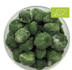
Wheatgrass juice (4g) 4180-14 ready to eat 2247-18 ready to heat