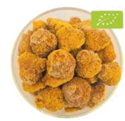
Turmeric puree (4g) 2246-18 ready to eat 0238-17 ready to heat