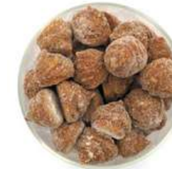
Mexican mix (4g) 2468-18 ready to heat