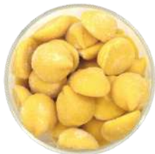
Mango puree (4g) 3851-17