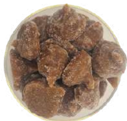
Cold Brew coffee (4g) 3747-22