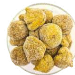
Yellow curry paste (6g) 0906-20 ready to heat