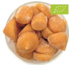
Acerola puree (4g) 2124-18