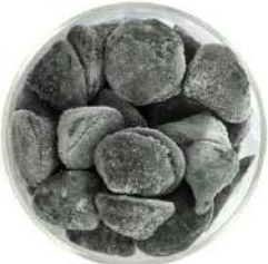
Spirulina 10% (4g) 3616-16 ready to (h)eat