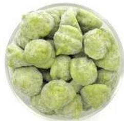
Chili green puree (4g) 2134-18 ready to heat