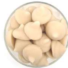
Sunflower frappé base (6g) 2331-21