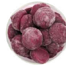
Beetroot puree (8g) 0580-18 ready to eat 2453-15 ready to heat

At first sight, these are the most classic ingredients of our product range. But our high quality sources in combination with our technologies transform them to incomparable solutions. The difference between processing vegetables purees yourself or just being able to use a ready made one is a gamechanger for your production. Using pellets makes it even more convenient by making way with weighing and portioning.