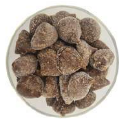
Caramel booster (4g) 3540-22