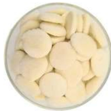
Vegan cheese sauce