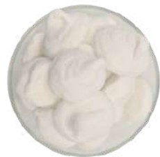
Coconut frappé base (6g) 0305-23