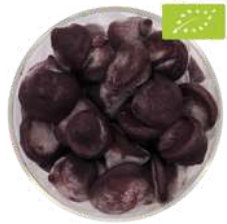
Açaí puree (4g) 4508-14

It's perfect for portion controlled smoothies, juices, shakes, ice creams and sorbets