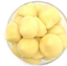
Tropical roots (6g) 1662-20 Pineapple, ginger, lemon juice, lemon zest

It doesn't get any fresher than this. Drops made from real fruit, real spices, real herbs . All blended and mixed very fine to give you that aroma and feel that boosts your water to the next level.