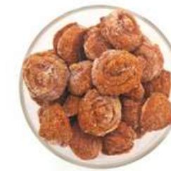
Red Curry paste (6g) 0904-20 ready to heat