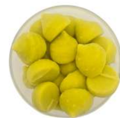
Herbal apple & citrus (6g) 5243-22 Apple, orange juice, lemon juice, orange peel, tarragon