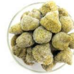
Green curry paste (6g) 0905-20 ready to heat