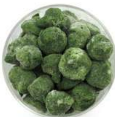
Parsley puree (4g) 3344-16 ready to heat