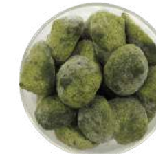
Kale puree (8g) 1986-15 ready to eat 3764-15 ready to heat