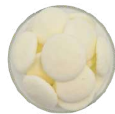
Vanilla frappé base (6g) 1746-15