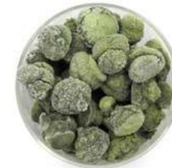
Mediterranean mix (4g) 2469-18 ready to heat