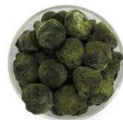
Mint puree (4g) 3345-16 ready to heat