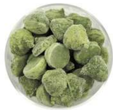
Basil puree (4g) 4988-16 ready to heat

Our single herb purees are very fine purees made of the fresh leafy greens and stems of the plants. They contain more than 50% of high quality by-product. The spices are acquired from the other parts of the plant – the roots, stems, bark, and seeds. We are also very proud of our herb & spice mixes. In a small dose, you can bring a world of different flavors to your dishes.