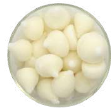
Lemon juice (4g) 3502-16