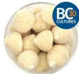
Probiotic booster 0639-23 appel, probiotic blend (organic inulin, bacillus coagulans gbi-30 6086)