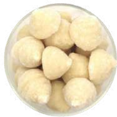
Prebiotic booster 2909-23 apple, fiber (corn)