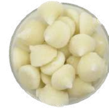
Parsnip puree (8g) 3511-17 ready to eat 3482-15 ready to heat