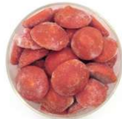
Chili red puree (4g) 3744-18 ready to eat 2585-18 ready to heat