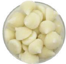
Lime juice (4g) 3501-16