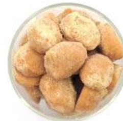
Galangal puree (4g) 3749-18 ready to eat 3748-18 ready to heat