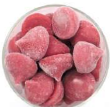
Strawberry puree 4018-18 ready to eat 2470-18 ready to heat