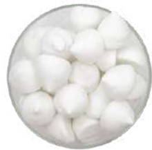
Coconut milk (4g) 1731-16