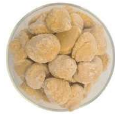
Maroccan houmous drops