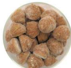
Barbecue sauce drops