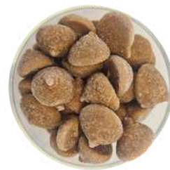
Spiced Chai booster (6g) 0842-23