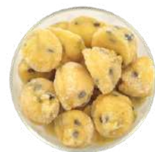
Passion fruit with seeds (4g) 0592-16