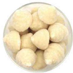
Pea Protein booster 5137-22 apple, pea protein isolate, natural flavour

Proven functionality, right dosages and secured throughout the whole shelf life of your product. Easier said than done. But look, here they are, 3 products that do not only make you feel better, stronger or healthier, but in fact really work! The neutral carrier apple puree combined with the 4g weight gives kitchens and industrial assembly lines the opportunity to guarantee accurate dosing, with minimal flavour impact.