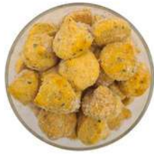
Red pesto drops