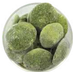
Kaffir lime leaf (4g) 3751-18 ready to heat